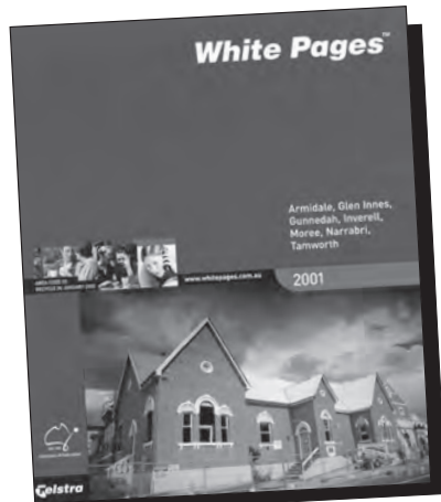
Hutchies' restoration work in Tenterfield features on the front page of the local telephone directory.