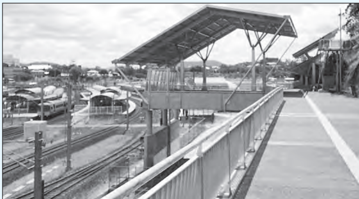
Roma Street redevelopment Package 31 – one of the shade canopies in the package incorporating roof truss structure, offices, aggregate and structural steel shade canopies.