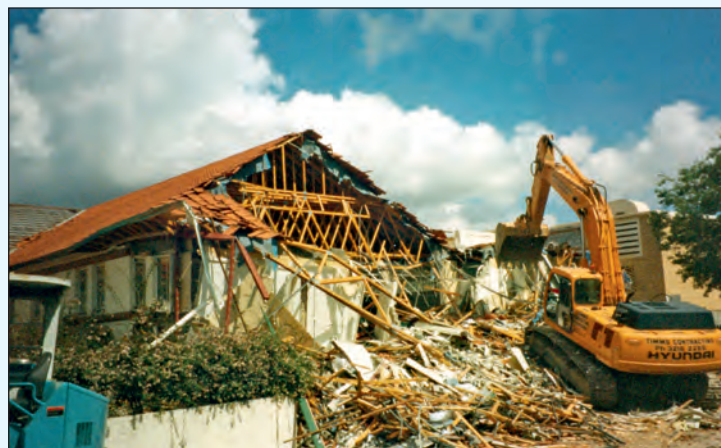
Demolition makes way for new Coles store in Racecourse Road, Ascot.