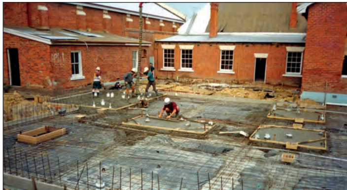
Restoration includes theatre, library and museum.