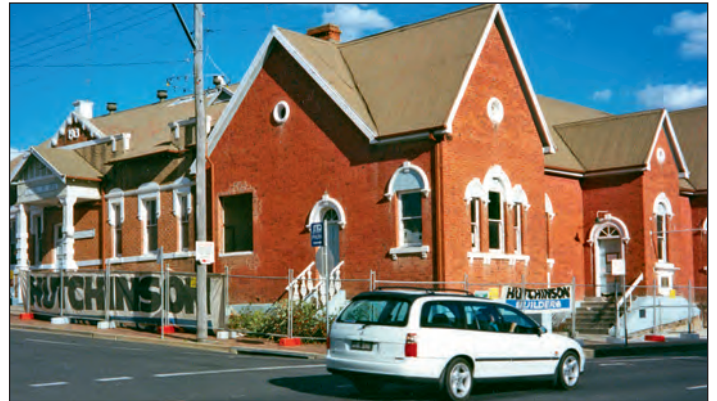
Hutchies' experience of working on heritage listed buildings helped win the contract for restoration of the School of Arts in Tenterfield, New South Wales.

Hutchies were awarded the contract from a select list of